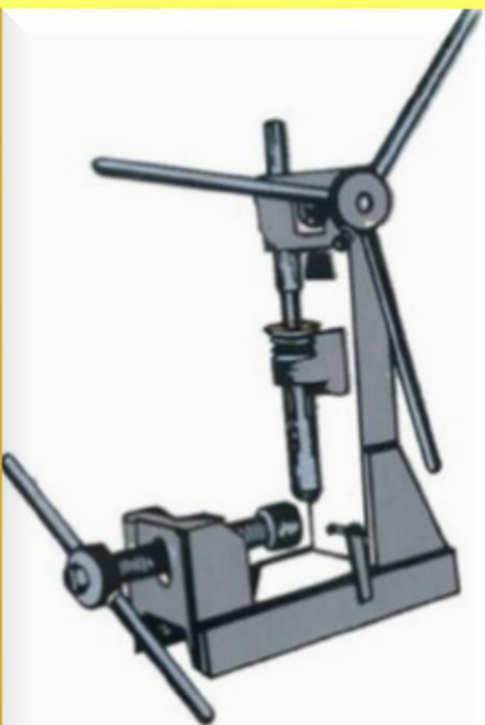
MANUAL OPERATED PLASTIC MOULDING MACHINE